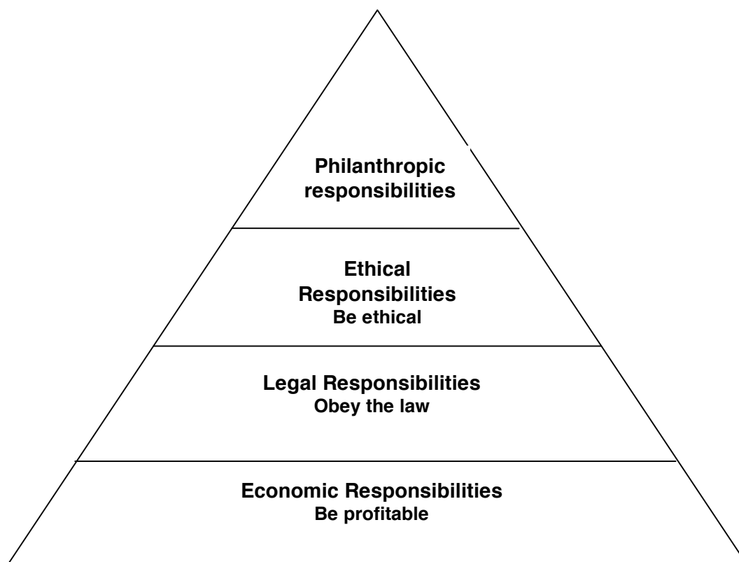
Figure 4: Adaptation of Carroll's (1991) social pyramid.